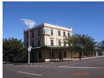
Oriental Hotel (former),